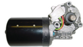
Wiper Motors Johnson Electric Dong Jinco

Complete line of Heavy Duty Wiper Blade replacement for: COACH AND TRANSIT, BOSCH - DOGA - SWF - SPRAGUE - ANCO - TRICO AM EQUIPMENT - DONG JINCO - JOHNSON ELECTRIC